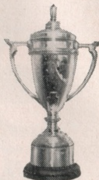
F.A. Youth Cup 1960 and 1961