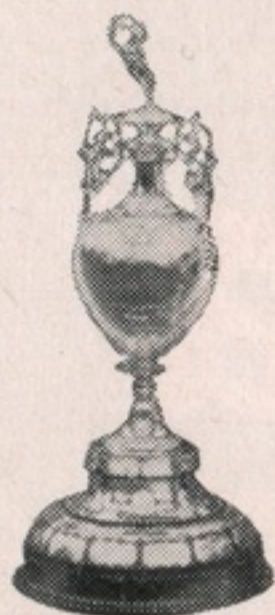
League Champions 1955